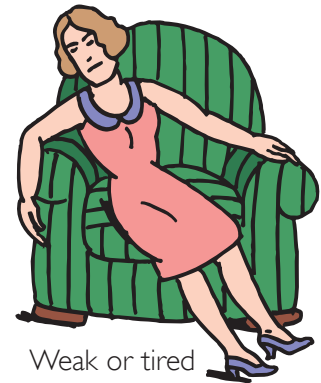
Weak or tired