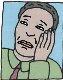
Weak or tired