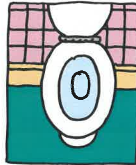
Need to urinate often