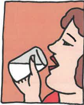
Thirsty all the time