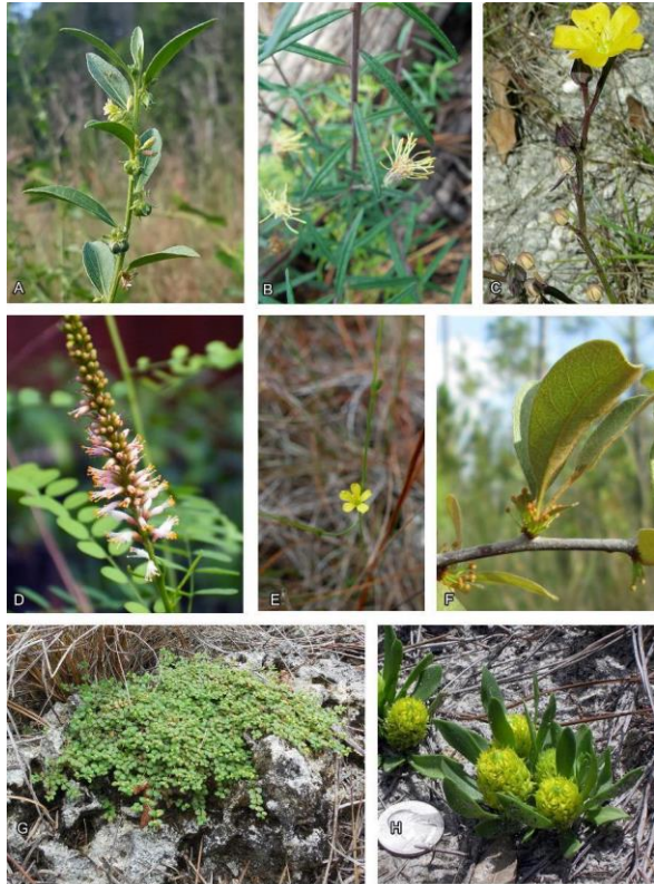
Figure 2: Some of the federally listed plant species found in the Richmond tract.

The remote sensing analysis increased recognition of non-traditional areas as critical habitat for endangered species. Due to decades of fire suppression, desirable vegetation characteristics (such as high native species richness, low invasive species cover, and presence of endangered fauna) were higher in mowed areas than in adjacent unmanaged forested areas of the US Coast Guard property. This revealed that a carefully selected mowing regimen is very important in the context of fire suppression.