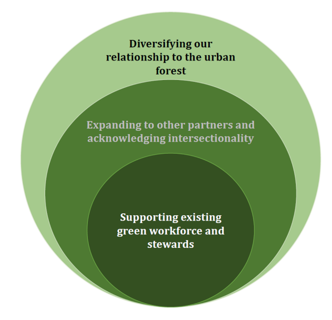
Fig. 1. Key themes mobilizing a community forestry ethos, organized (smallest to largest circles) from the organizational level, to collaborative partnerships across networks that acknowledge intersectionality, to interactions with the ecosystem.

Urban and community forestry involves much more than planting trees. Care and maintenance work are often unvalued or undervalued in our current structures and economies (Puig de la Bellacasa, 2011; Larrabee, 2016). It is clear that cultivating human capacity helps support green spaces that are functioning not just as natural resources but also as