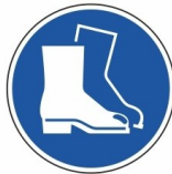
Closed in shoes