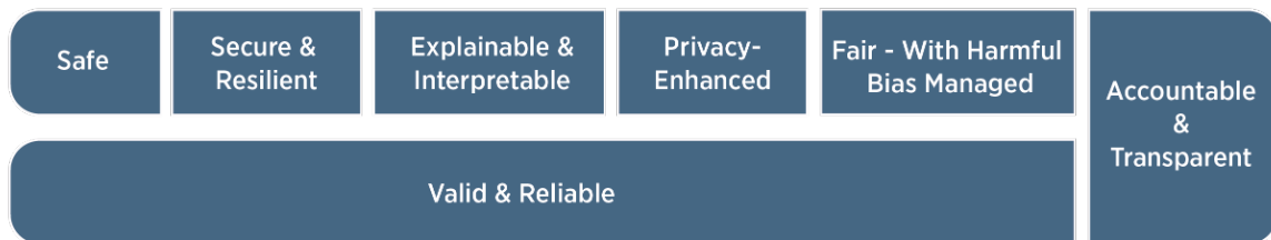
Fig. 4. Characteristics of trustworthy AI systems. Valid & Reliable is a necessary condition of trustworthiness and is shown as the base for other trustworthiness characteristics. Accountable & Transparent is shown as a vertical box because it relates to all other characteristics.

For AI systems to be trustworthy, they often need to be responsive to a multiplicity of criteria that are of value to interested parties. Approaches which enhance AI trustworthiness can reduce negative AI risks. This Framework articulates the following characteristics of trustworthy AI and offers guidance for addressing them. Characteristics of trustworthy AI systems include: valid and reliable, safe, secure and resilient, accountable and transparent, explainable and interpretable, privacy-enhanced, and fair with harmful bias managed . Creating trustworthy AI requires balancing each of these characteristics based on the AI system's context of use. While all characteristics are socio-technical system attributes, accountability and transparency also relate to the processes and activities internal to an AI system and its external setting. Neglecting these characteristics can increase the probability and magnitude of negative consequences.