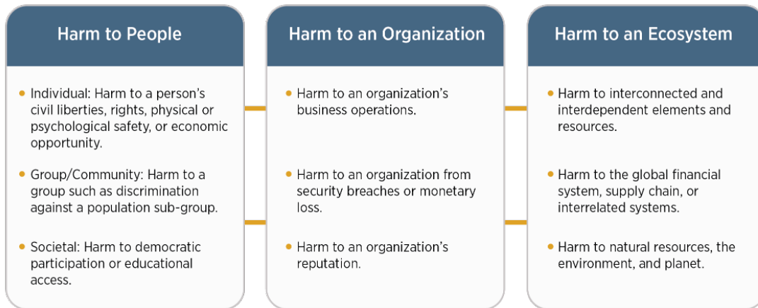
Fig. 1. Examples of potential harms related to AI systems. Trustworthy AI systems and their responsible use can mitigate negative risks and contribute to benefits for people, organizations, and ecosystems.