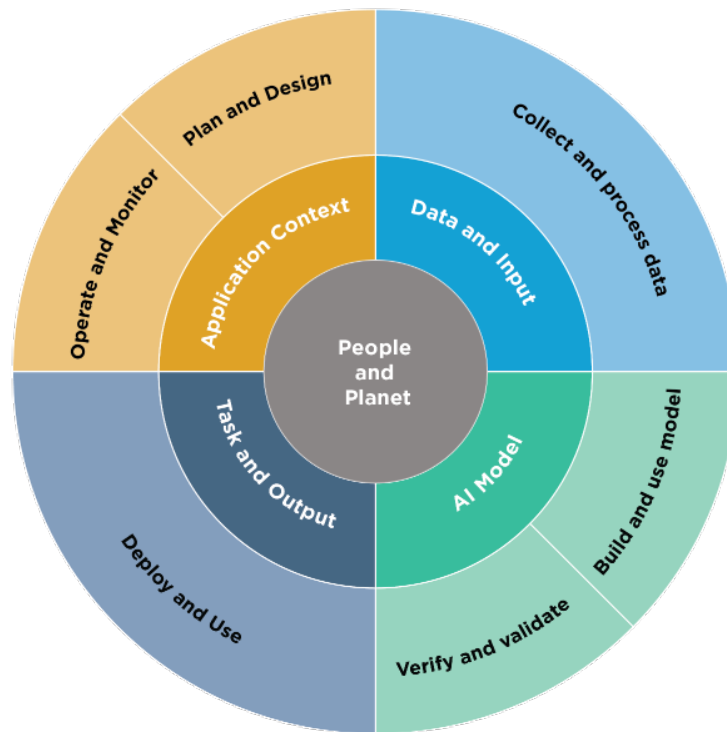
Fig. 2. Lifecycle and Key Dimensions of an AI System. Modified from OECD (2022) OECD Framework for the Classification of AI systems — OECD Digital Economy Papers . The two inner circles show AI systems’ key dimensions and the outer circle shows AI lifecycle stages. Ideally, risk management efforts start with the Plan and Design function in the application context and are performed throughout the AI system lifecycle. See Figure 3 for representative AI actors.

environmental groups, civil society organizations, end users, and potentially impacted individuals and communities. These actors can: