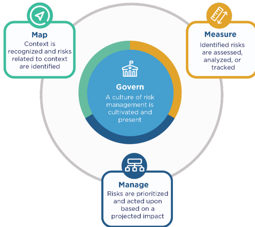
Fig. 5. Functions organize AI risk management activities at their highest level to govern, map, measure, and manage AI risks. Governance is designed to be a cross-cutting function to inform and be infused throughout the other three functions.

The AI RMF Core provides outcomes and actions that enable dialogue, understanding, and activities to manage AI risks and responsibly develop trustworthy AI systems. As illustrated in Figure 5, the Core is composed of four functions: GOVERN , MAP , MEASURE , and MANAGE . Each of these high-level functions is broken down into categories and sub-categories. Categories and subcategories are subdivided into specific actions and outcomes. Actions do not constitute a checklist, nor are they necessarily an ordered set of steps.