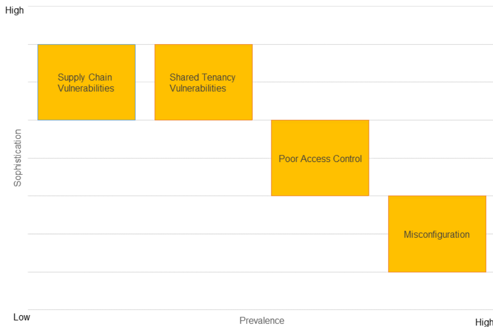
Figure 2: Cloud Vulnerabilities – Prevalence versus Sophistication of Exploitation

Mitigating cloud vulnerabilities is a shared responsibility between the CSP and the customer organization. Critical to an organization’s success in both transitioning to the cloud and maintaining cloud resources is support from informed leadership, which ensures the right governance, budget, and oversight. With this support, administrators are able to enable effective mitigations for cloud resources. Cloud technology moves rapidly, making oversight a complex task. Organizations need dedicated resources commensurate with the size of the organization to ensure adequate protection in the cloud. Additionally, customers should work with their CSPs to understand available vendor-specific countermeasures and their impact on risk.