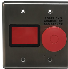
ADC-EB-55A-EM 4.5" Combo Push Button & LED Annunciator