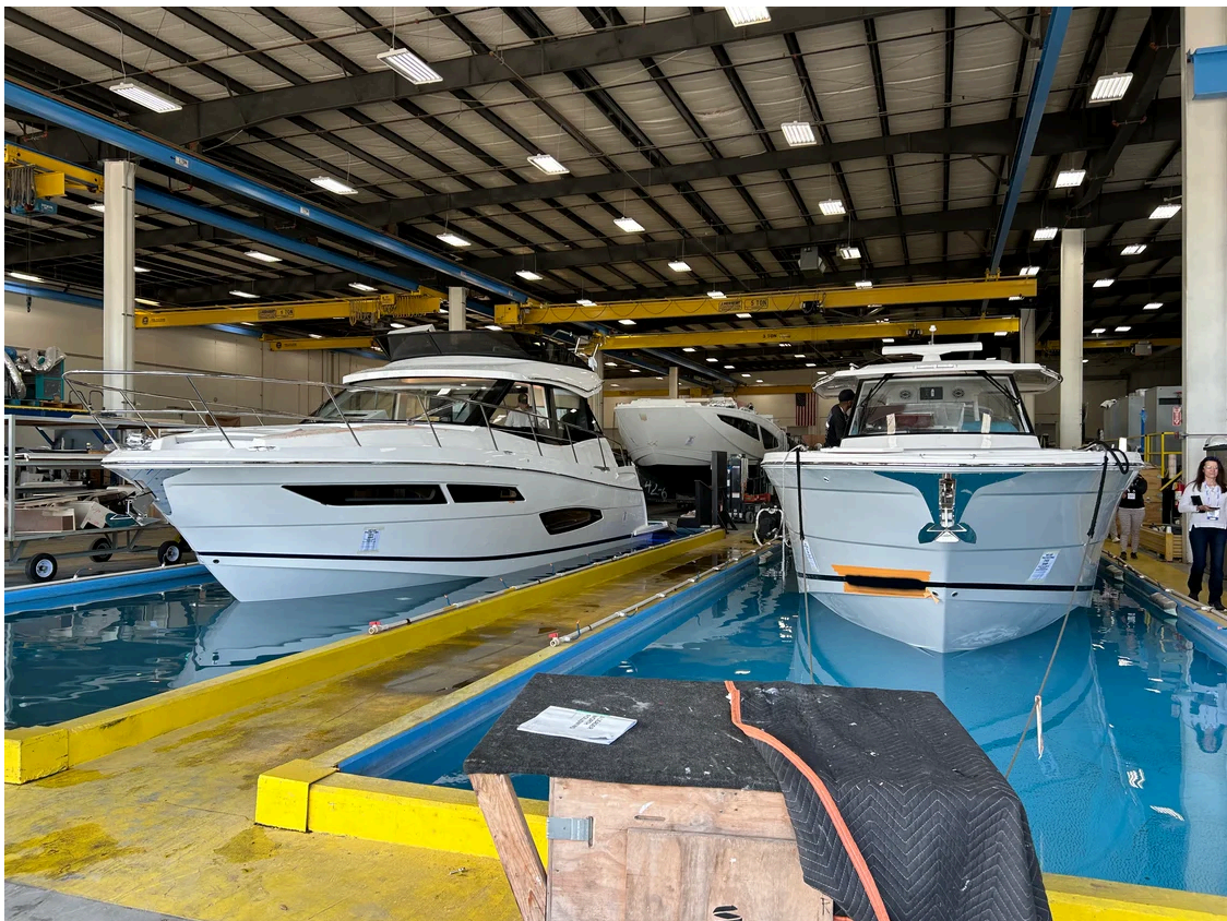
American Coatings Show