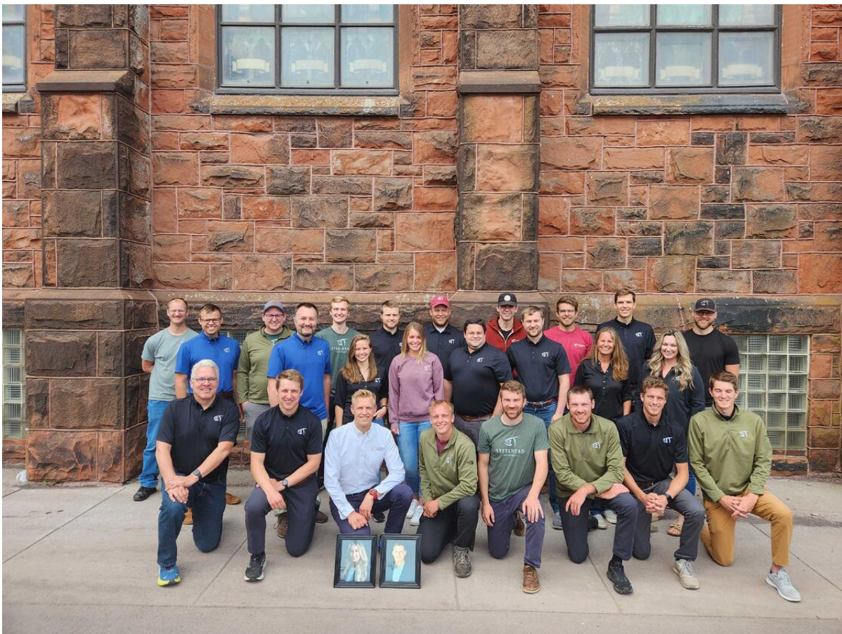
Image of the growing team at the Summer Steelhead Run where Steelhead employees meet to brainstorm strategies and initiatives to improve.